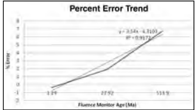
Graph 1. Percent error between the Ar and Age Ratios for various fluence monitors

There appears to be a relationship such that the older the assumed date of the standard sample, the more the results err from the foundational equations. This relationship needs further exploration.