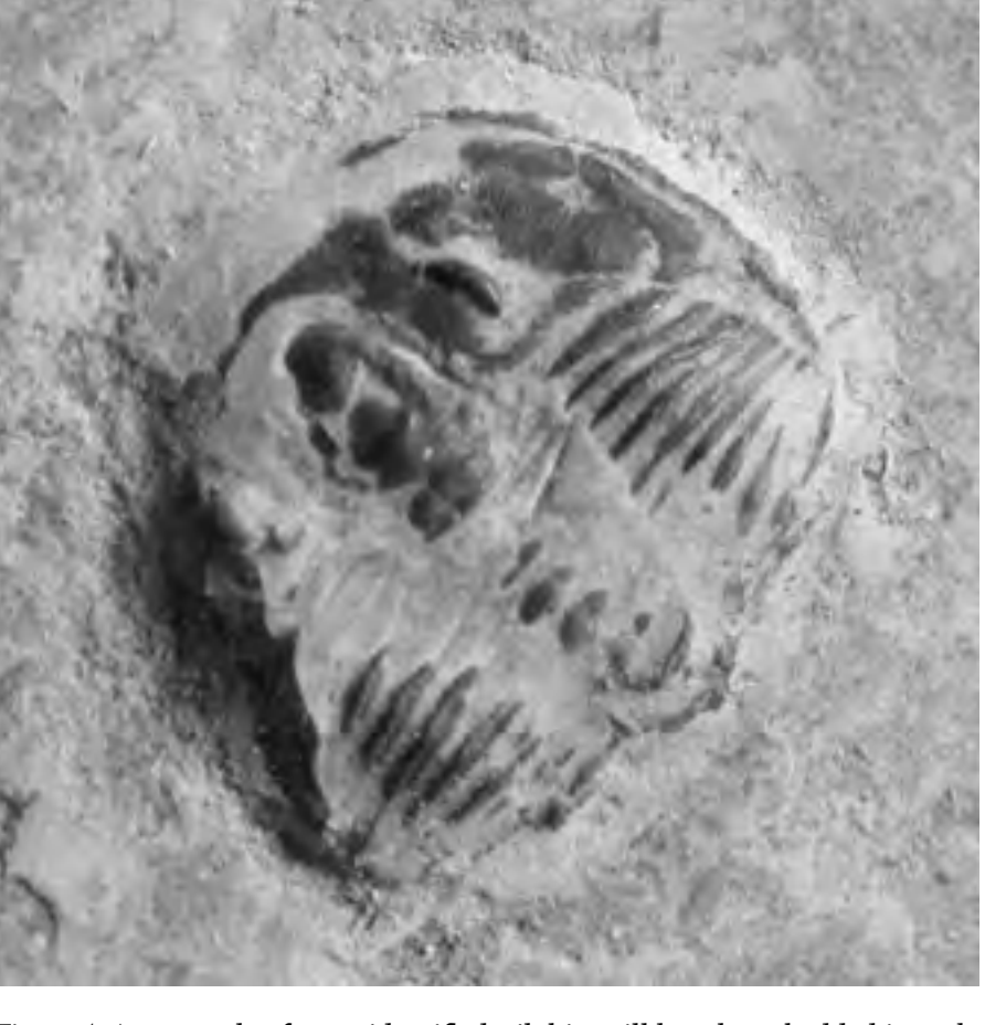
Figure 4. An example of an unidentified trilobite still largely embedded in rock, showing the challenge of removing them from solid rock. It is partly rolled up in a ball and appears to have been forced into the mud.

A large amount of variety exists in both the body and the eye design of