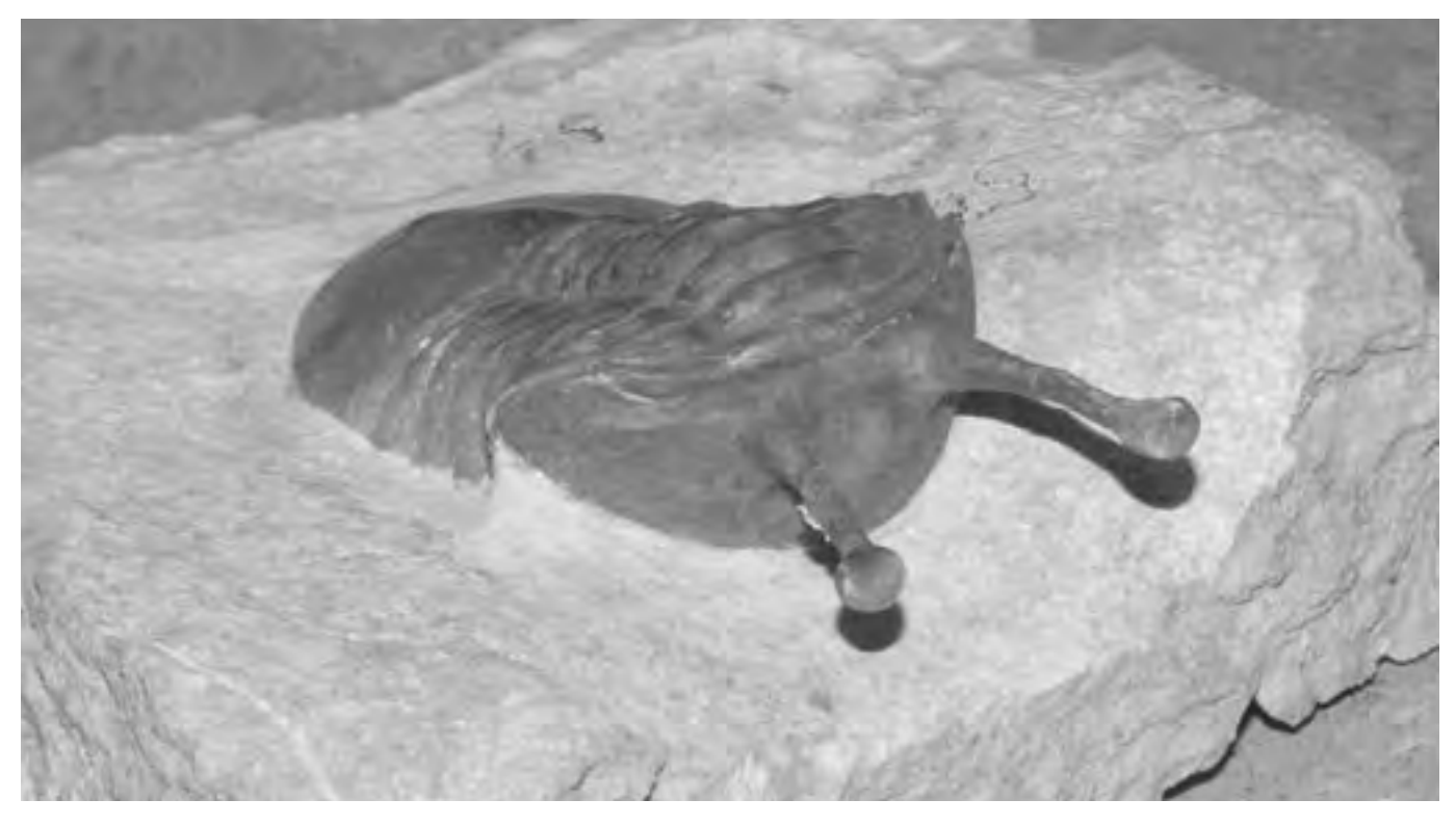
Figure 3. An unusual trilobite that contains prominent eyestalks.

the Trilobita, but none for its putative ancestors. For this reason migration does not explain their sudden appearance in the fossil record. Another problem is that the wide "diversity of fossil trilobites poses a challenge to traditional evolutionary theory" (Eldredge, 1980, p. 47) because no evidence exists that they evolved elsewhere.