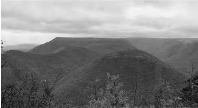
Figure 2. Planation surface at Cape Breton Highlands, taken from Sugarloaf Mountain, looking south.