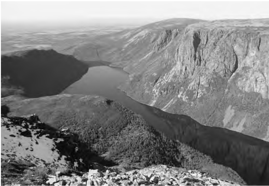
Figure 17. Ten Mile Pond Canyon, beside Gros Morne Mountain, is another example of some of the dramatic, steep-walled canyons that were cut into the planation surface. In this case, the walls are in excess of 700 meters high.

This model also argues against the possibility that the planation surface was cut at a lower elevation and later