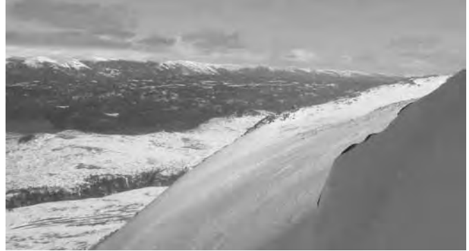
Figure 5. Looking southeast from about 50 m below the planation surface on the Tablelands. This was as high as I could climb due to snow and ice.