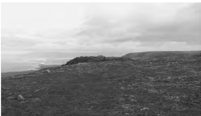
Figure 4. View from atop Table Mountain, near Port Aux Basques, Newfoundland, looking north toward the other planed mountaintops.