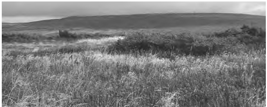
Figure 9. On top of Table Mountain, near Port Aux Basques. The planation surface here is also covered in scrub brush and bog, with some occasional felsenmeer exposed through the bogs.