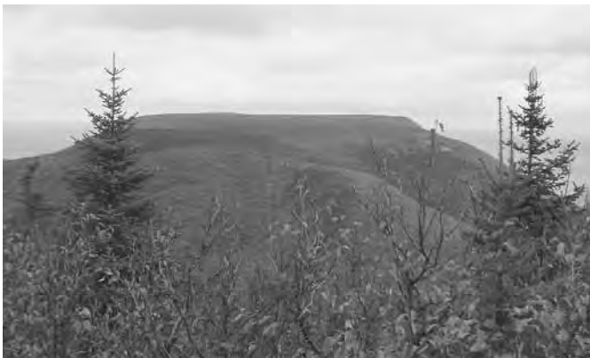
Figure 3. Planation surface at Cape Breton Highlands, taken from Sugarloaf Mountain, looking north toward Newfoundland across the Cabot Strait.