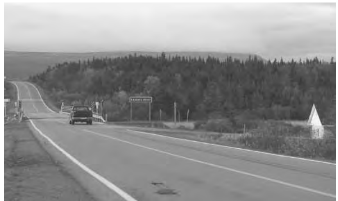
Figure 6. Last view of the planation surface at the northern tip of the Northern Peninsula.