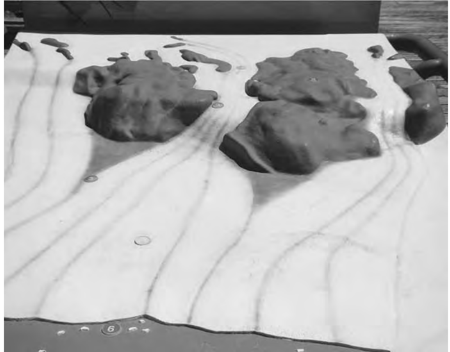
Figure 14. National Park model of the Western Brook Pond area with proposed glaciers. There is no doubt there were glaciers in the canyons, but did the glaciers cut the canyons? Notice that the glaciers are absent from the top of the planation surface.

Note the virtual absence of moraines. Significant amount of rock was removed in the carving of these canyons, which undoubtedly wound up in the ocean. But could glacial action cut canyons in that way? Western Brook Pond (the center canyon in the model of Figure 15) is one of several steep-walled box canyons cut into the mountains of Gros Morne National Park (Figure 16). Western Brook Canyon has very steep, 700-m-high walls. Another example is Ten Mile Pond Canyon (Figure 17), with walls in excess of 780 m and virtually nonexistent moraines at the canyon mouth. The small moraines cannot account for a fraction of the sediments removed during canyon formation. The lack of talus and large river delta suggests the canyons best match the erosion of a receding waterfall—like the Niagara Gorge. Yet there appears to have been no sufficient water source (no reservoir large enough to account for the volume of water that would have been needed) to feed such a waterfall to cut the canyon. However, the Flood scenario, with broad sheet flows being constricted to powerful channelized currents, would explain both the planation surface and the numerous canyons.