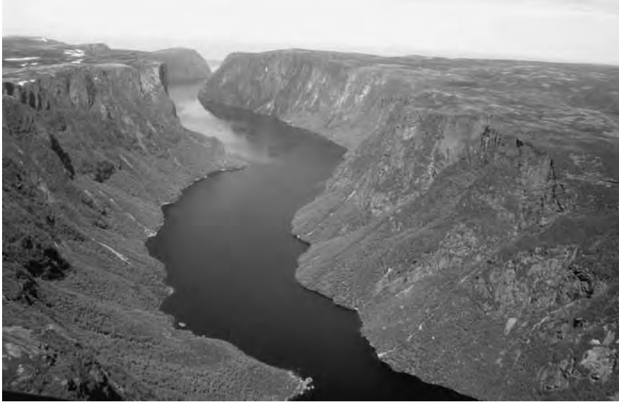
Figure 16. Western Brook Pond Canyon, looking down the canyon to the ocean, has extremely steep, 600-meter walls. It is highly unlikely that glacial action carved this and many other canyons in the mountain ranges here in Gros Morne National Park.