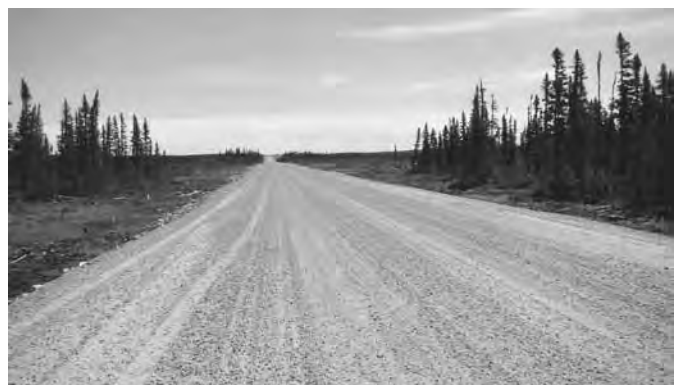
Figure 7. The new Trans-Labrador highway crosses over the top of the planation surface.