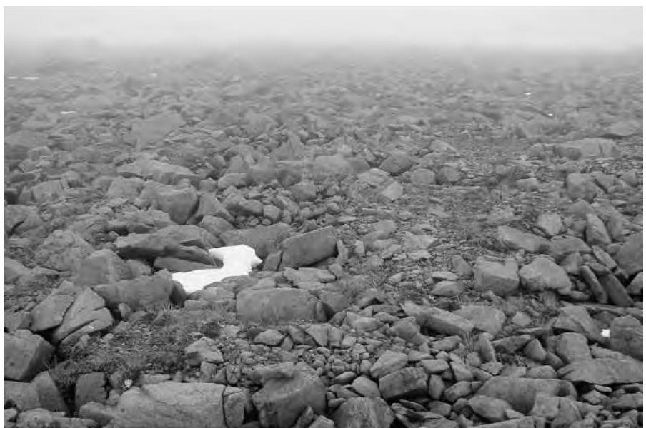
Figure 10. On top of Tablelands Mountain, Gros Morne National Park. The mountain here is composed of peridotite and capped with in situ felsenmeer .