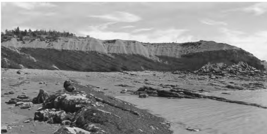
Figure 13. The cliffs of Joggins, Nova Scotia. Differential erosion caused by the tides stands in stark contrast to the planation of the very same layers at the top of the cliff.

1998; Oard et al., 2005; Oard 2000, 2008, 2011b), and have built a compelling case for planation surfaces being cut by fast-moving water. Their findings are supported by my observations at the Joggins Fossil Cliffs. Figure 13 shows the “reefs” in the Bay of Fundy, which are being eroded by the significant tidal action of the bay. The southward twenty-degree dip of the local strata can be seen in the cliffs. In the water, the softer rocks are eroded first. The harder rocks resist erosion and form the “reefs” jutting out of the water. However, the planation acted in a different manner. At the top of the cliffs, the exact same rocks have been sheared and are now flat and level, regardless of the hardness of the eroded rock. This is in stark contrast to the observable, present-day erosion process, which has produced the expected textbook example of differential erosion. Clearly these processes are not what cut the planation surface at the top of the cliffs. There are only three possible planing ( penplain is an outdated term, referring to Davis’s outdated cycle of erosion theory) processes that could do so: glacial action, fast-flowing water carrying abundant sediments and rocks that acted as cutting agents, or a high-velocity sheet flow of water flowing well above cavitation thresholds.