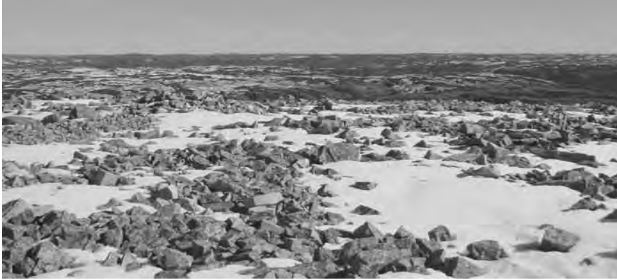
Figure 11. On top of Gros Morne Mountain, looking west. The mountains are all planed flat as far as the eye can see. The mountains here are capped with in situ felsenmeer.