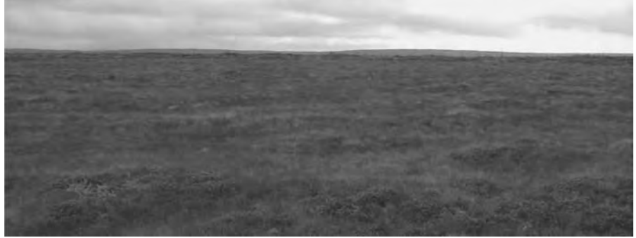
Figure 8. On top of the planation surface on the Cape Breton Highlands. This particular spot affords a good view; most of the surface is covered with dense scrub brush and deep bogs, making for extremely difficult hiking.

Oard and Klevberg have discussed the formation of planation surfaces (Klevberg and Oard, 1998; Oard and Klevberg,