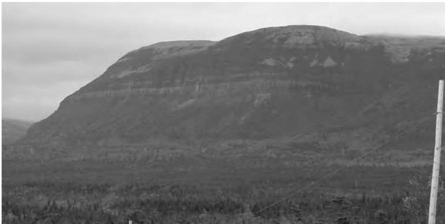
Figure 12. Horizontal sedimentary formations at the northern tip of the Northern Peninsula. The planation surface can be difficult to see when one is standing below the planation surface.