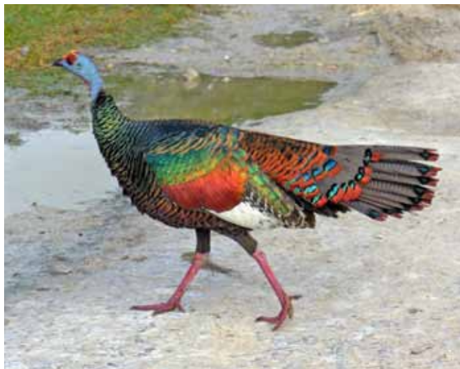
Figure 5. Family Phasianidae, Subfamily Meleagridinae. Ocellated Turkey ( Meleagris ocellata ).