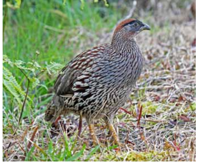
Figure 8. Family Phasianidae. Erckel's Francolin ( Pternistis erckelii ).

of economic value such as grouse merit a great deal of attention.