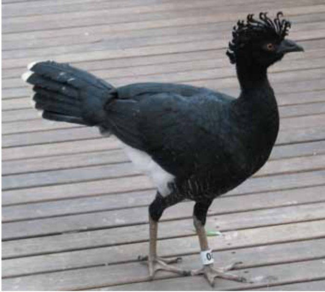
Figure 3. Family Cracidae. Yellow-knobbed Curassow ( Crax daubentoni ), female, captive bird.