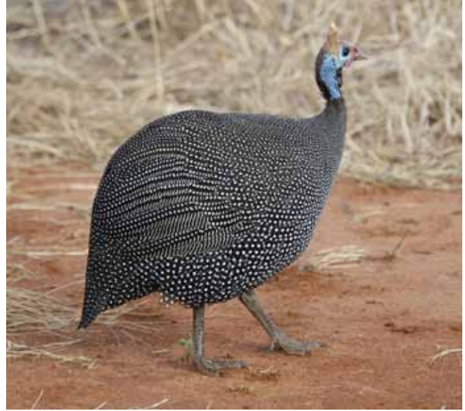
Figure 4. Family Numididae. Helmeted Guineafowl ( Numida meleagris ). Except for the genus Agelastes , the finely dotted plumage is a hallmark of the guineafowl.

other landfowl, the young are fed by both parents for a considerable time until independence is reached.