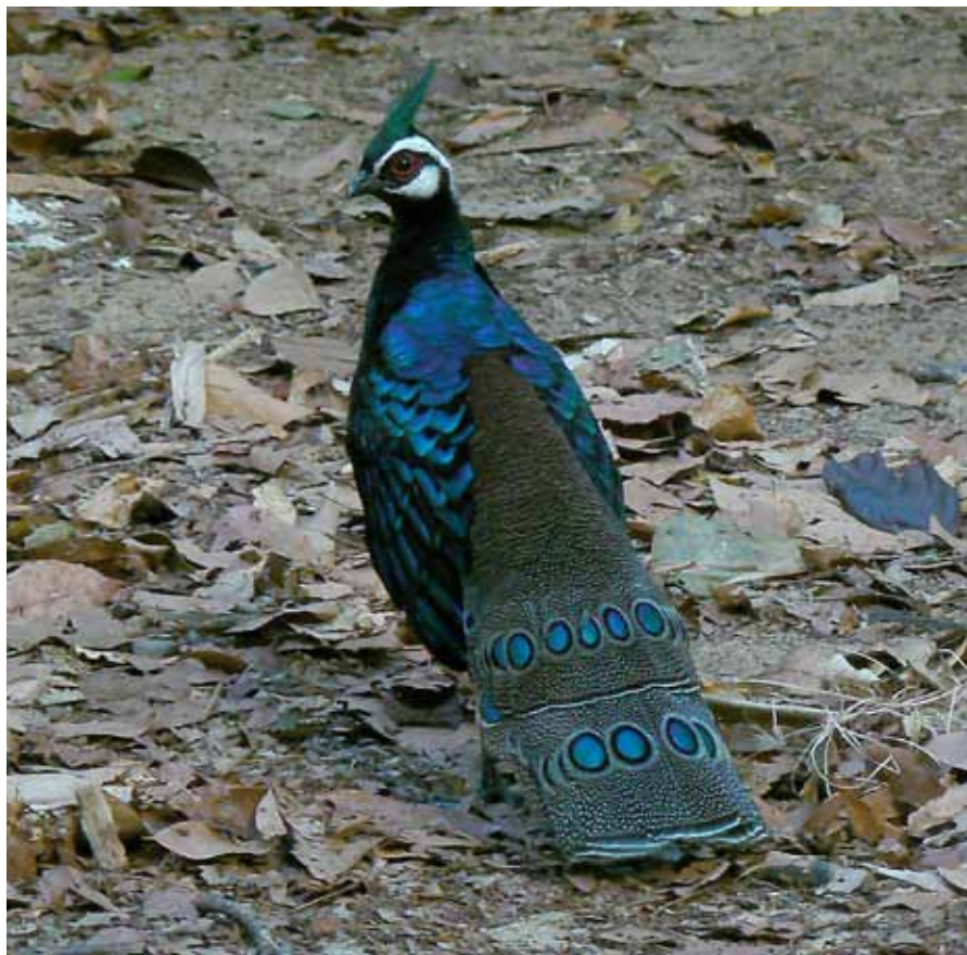
Figure 10. Family Phasianidae. Palawan Peacock-Pheasant ( Polyplectron napoleonis ). The iridescent ocelli (“eyes”) on the wing and tail feathers are reminiscent of those of peafowl and are an indication of relationship between the two groups.

These excrescences are usually brightly colored; some may be erectile (via blood supply) or inflatable, attached to the cervical air sac system. Some in-