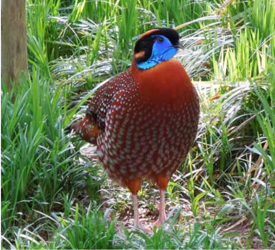
Figure 9. Family Phasianidae. Temminck's Tragopan ( Tragopan temminckii ), male. During courtship the bright blue skin around the face and neck can be inflated into an impressive structure.

tudes from sea level to alpine grasslands above the timber line. Likewise, the breeding habits vary from monogamy to extreme polygyny in which the only pair-bond occurs during mating.