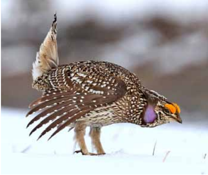
Figure 7. Family Phasianidae, subfamily Tetraoninae. Sharp-tailed Grouse ( Tympanuchus phasianellus ).