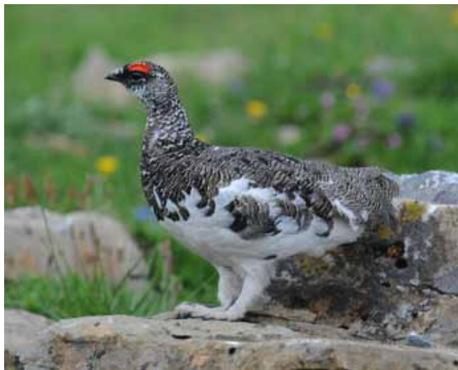
Figure 6. Family Phasianidae, subfamily Tetraoninae. Rock Ptarmigan ( Lagopus muta ), spring plumage (molting), showing fully feathered feet and toes.

eggs, incubated by the female alone with the male standing guard nearby.