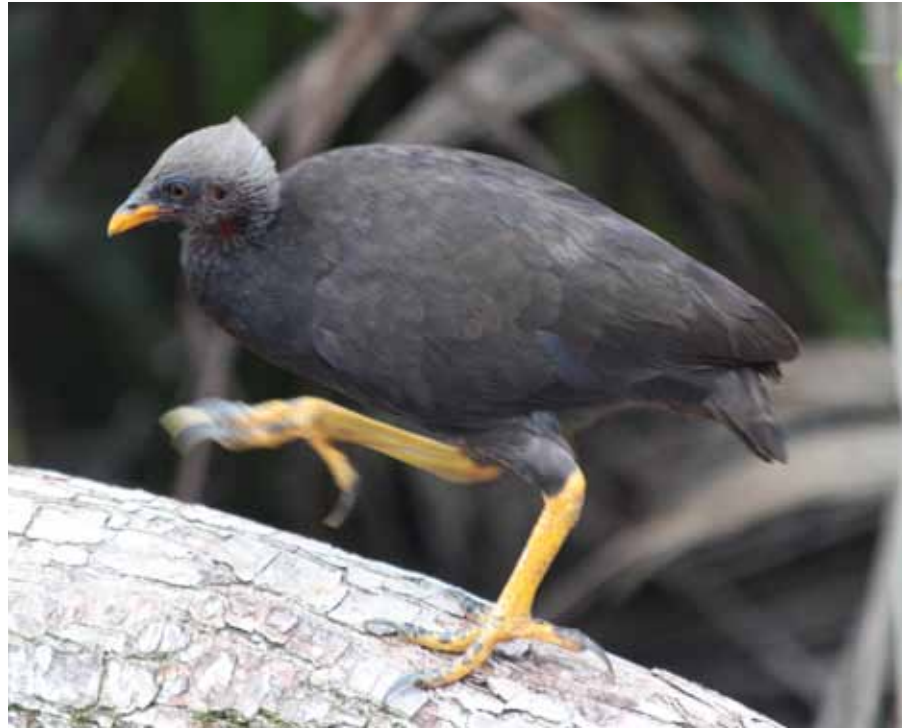
Figure 1. Family Megapodiidae. Micronesian Megapode ( Megapodius laperouse ), running. Note large feet characteristic of the family.

“Megapode” is a reasonable substantive name for the group. The genus Megapodius derives from the Greek μέγας (“large”) and πούς, ποδός (“foot”), and alludes to the fact that the birds have outsized feet for their size. (Figure 1)