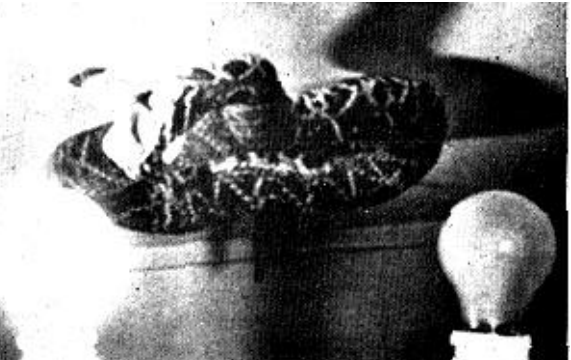
Figure. 1. Grouper fish (Epinephelide) and small fish Figure 2. Blindfolded rattlesnake hits light bulb.