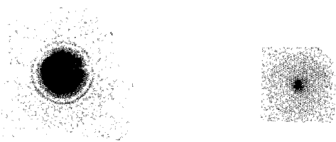
Figure 1. A uranium-238 halo (left) and a polonium-210 halo in biotite. Scale is 1 cm equivalent to 26.5 \mu m.

That is where the enigma begins. For Gentry has analyzed numerous polonium halos possessing, in some cases, the rings for all three polonium isotopes; in other cases the rings for ^{214}\text{Po} and ^{210}\text{Po} ; and in other cases, the ring for ^{210}\text{Po} alone—but none of these halos exhibits rings for the earlier uranium-238 daughters. These halos are evidence for parentless polonium, not derived from uranium.**