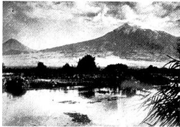
Figure 1. Greater Ararat and Lesser Ararat, looking Southwest, from the Aras river—the boundary line between Turkey and Russia. Ahora gulch is in the foreground of Greater Ararat.

Greater Ararat is perpetually covered with an ice capping down to the 14,000 foot level in