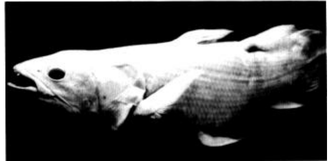
Figure 5. Coelacanth, photographed in the Science Museum in London.

of the "hopeful monster," progressing by great leaps (Gould, 1977, p. 22).