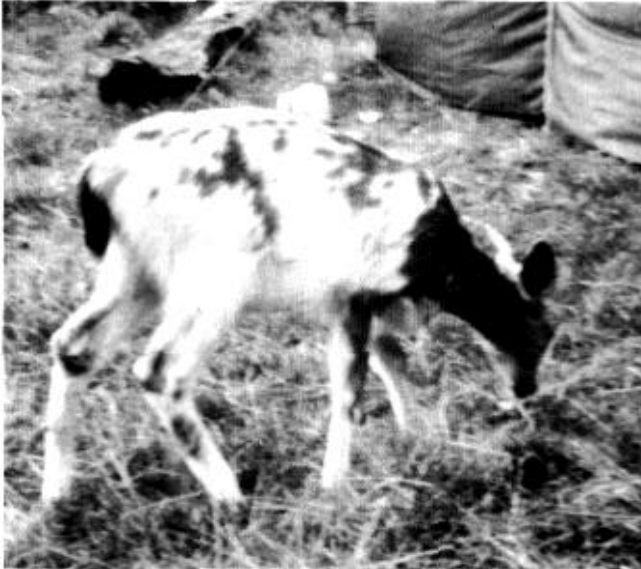
Figure 3. Partial albinism in mule deer ( Odocoileus hemionus ) which invaded the author's camp in Olympic National Park. WA.

siblings. In the black leopard, spots can still be seen although largely masked by the melanism. In animals melanism is a minority or recessive trait, and ordinarily would seem to decrease the likelihood of survival. Partial melanism is found in the dark phase of hawks such as the rough-legged ( Buteo lagopus ), ferruginous ( B. regalis ), red-tailed ( B. jamaicensis ), Swainson's ( B. swainsoni ), Harlan's ( B. harlani ), and short-tailed ( B. brachyurus ).