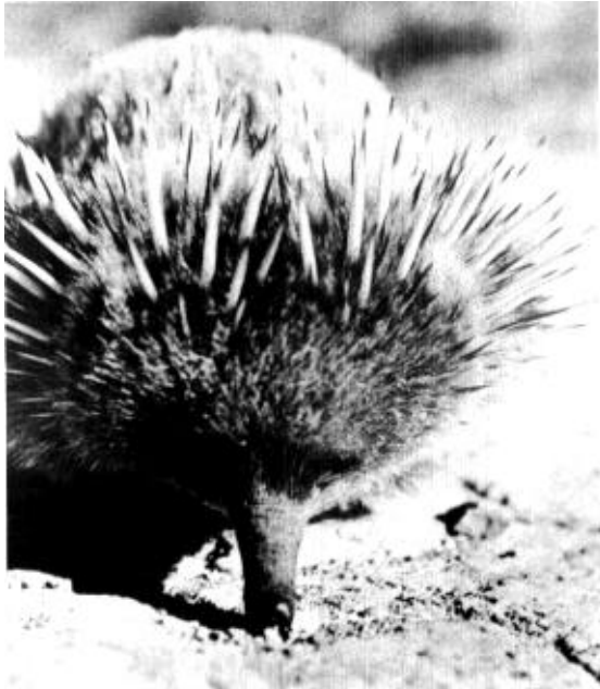
Figure 4. Tasmanian echidna ( Tachyglossus aculeatus ) of the same species as that found in Australia and New Guinea.