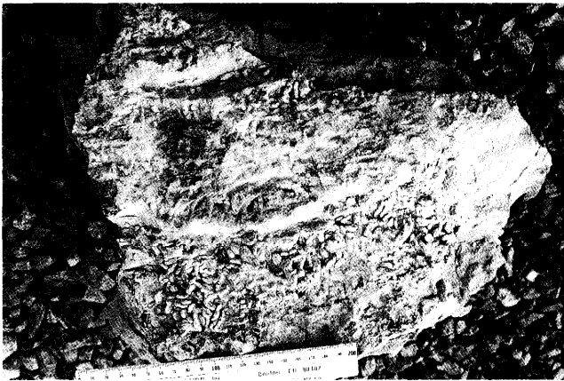
Figure 4. This rock surface is interpreted to represent fecal pellets and traces probably resulting from invertebrate animals (insects, worms, etc.). These animals may have fed on the organic matter in the Dinosaur Ridge deposits that was not deposited as charcoal. The ruler numbers the millimeters every centimeter.

small invertebrate animals feeding on the substrate debris after deposition but before its lithification. A passage of time would be indicated by the fecal pellets and the other trace fossils in the rock, but they provide no support for million-year interpretations of the Dakota Formation deposit. The use of trace fossils within the framework of the young-earth Flood model has been discussed in Cowart and Froede (1994).