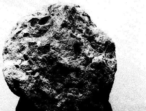
Figure 2. The dark hematite has served to preserve the wood grain orientation (shown by the arrow direction for the fragments to the left and right of the arrow). Some of the wood fragments found within this layer have sharp fractures perpendicular to the wood grain, indicating that they are likely to be derived from charcoaled wood and not green wood.

the 200 meters of rock in the combined Morrison and Dakota Formations at Dinosaur Ridge. Strict uniformitarianism would thus give an average net deposition rate of four micrometers per year. I made no attempt to fit all of the Dinosaur Ridge strata deposition into the single year of the Genesis Flood. Additional work is required to make this determination.