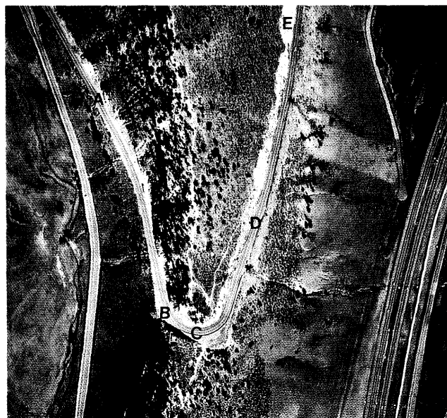
Figure 3. An aerial view of a portion of Dinosaur Ridge with north at the top. Dinosaur bones are to the right of the A. Invertebrate trace fossils are at B and E. Most of the plant fossils are at C and some at D. The 120 meter interval between C and D contains some symmetric long-crested ripples. A few dinosaur footprints are located between A and B and hundreds of prints are just north of E.

Wood Grain — Additional samples of the plant fragments at Dinosaur Ridge have been found with excellent surface detail preserved. These are present where hematite concretion material has been deposited against the wood fragments. The fragment casts have a durable reddish brown surface. Casts without the hematite have a coarser, sandy surface with and without black colorations. The remarkable feature of the hematite