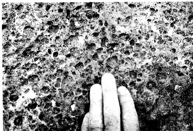
Figure 7. These hollow depressions in the Dakota Formation on the east side of the ridge at Canon City appear to be from balls of light-colored clay and not broken plant matter.

Previous findings of the charcoal occurred about two-thirds of the way up through the Dakota Formation near Dinosaur Ridge. The same stratum was therefore examined at that level along Skyline Drive, on the hogback ridge on the west side of Canon City, Colorado, about 140 km south of Dinosaur Ridge. A much thinner (up to 20 cm) deposit of apparent charcoal and plant fragments (some large bark pieces) of the usual texture was found on the west side of the ridge north of where the road reaches the crest (at the road cut to the left side of Figure 6). The layer itself was a bedding plane in the context of the much thicker adjacent layers of sand, but the plant fragments were mixed with sand throughout that thin layer. Adjacent layers of sand had cross bedding and some coarse sand up to small pebble sizes.