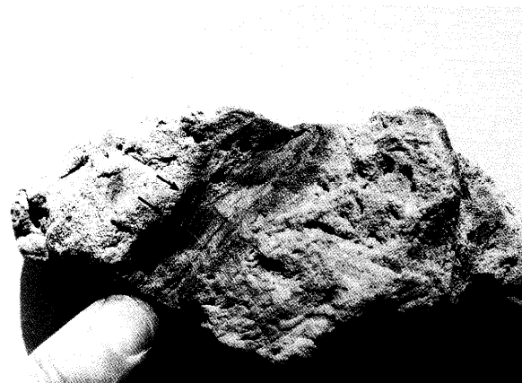
Figure 1. This is the only Dinosaur Ridge rock sample found by the author that appears to have an identifiable plant impression, that of an Equisetum sp. stem. The finger indicates the scale of the broad stem.

Holroyd (1992) also examined the 1989 Sugarloaf Mountain forest fire site two years later. Charcoal and sand were still accumulating in the creek bed of Black Tiger Gulch. Small trenches were dug into numerous