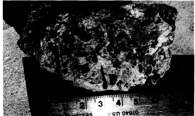
Figure 5. This rock from the Morrison Road cut through Dinosaur Ridge has an abundance of intact charcoal fragments, some showing wood grain direction. The scale numbers the centimeters of length.

The upper third of the Dakota Formation containing the fossil plant material (charcoal fragments) extends over a greater area at the Alameda Parkway site than previously indicated by Holroyd (1992). The charcoal fragment presence starts adjacent to the base of a 3.5 m thick channel sandstone (at “C” in Figure 3) at the Alameda Parkway road cut and extends to a thickness