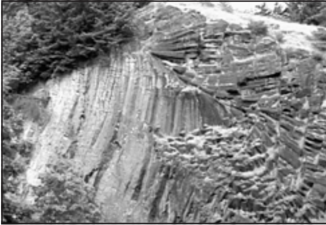
Figure 7. Columnar basalt showing the entablature structure. Located near the Coberg Hills, north of Eugene, Oregon.

1991; Long and Wood, 1986)[Figure 7]. Also see Snelling and Woodmorappe, 1998, p. 539. Jointing along with other tensional features which form within basalt flows (both subaerial and subaqueous) can help the researcher attempt to determine whether water played a significant role in the cooling of the basaltic lava flow (DeGraff, Long and Aydin, 1989).