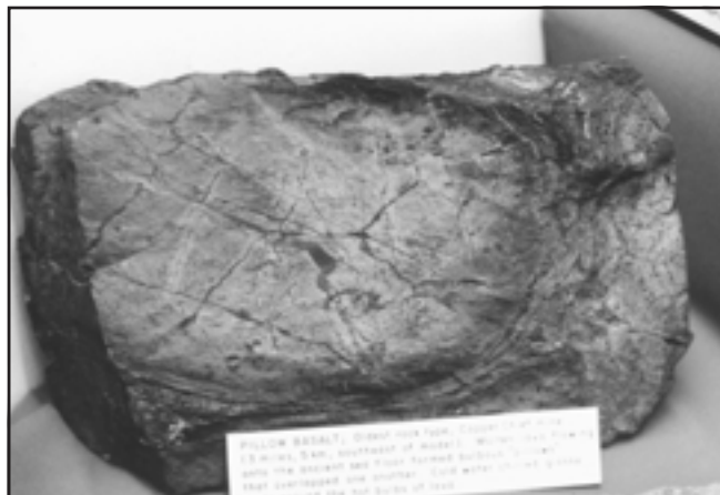
Figure 1. A block of basalt lava in pillow form taken from Copper Chief mine in Arizona. This basalt is associated with hydrothermal-produced mineral deposits and likely reflects events and processes associated with the Flood (See Froede, Howe, Reed, and Meyer, 1998). Jerome State Historic Park Museum.

Probably the most common form of basalt erupted underwater occurs in the form of pillows (Figure 1). These features occur where the rate of effusion is considered to be of low volume. Underwater photography of an ongoing basalt lava flow reveals a lava tube which lengthens as it flows un-