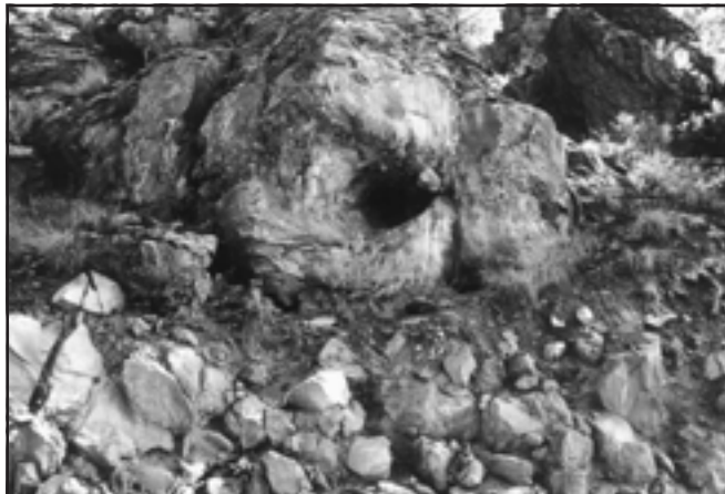
Figure 9. A lava tube in volcanic strata at the San Francisco Peaks in Arizona.