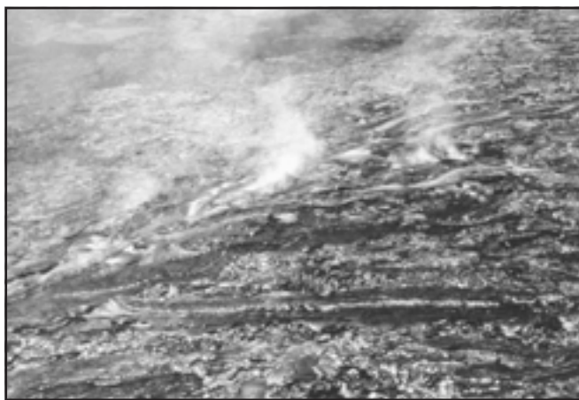
Figure 2. Basalt lava flows along channels across the surface of older flows. The chilled lavas are all pahoehoe lava flows. From Kilauea, Hawaii.

Extruded submarine basalt flows are not limited to pillow form. Where basaltic lava has erupted underwater it derives its shape from many factors such as the rate of eruption, crystalline content of the melt, slope surface, and temperature. This results in basaltic lava morphology variation from pillow lava to sheet flows to channel flows to brecciated blocks derived from the destruction of the individual pillow lobes (Carlisle, 1963; Cousineau and Dimroth, 1982; Goldie, 1983; Hargreaves and Ayres, 1979; Jackson, 1980; Ricketts, Ware and Donaldson, 1982; Yamagishi, 1991a; 1991b).