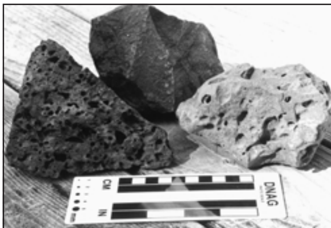
Figure 10. Basalt blocks with varying degrees of vesicles. The upper scale is in centimeters and the lower scale is in inches. These gas bubbles reflect the amount of volatiles present within the melt at the time the lava cooled.

likely that sheet-flow would occur. With the highest levels of flow wax pools formed which they believed would directly correspond to the formation of lava lakes. According to Orton (1996), the final morphology and facies of low-viscosity basaltic lavas are determined by the viscosity and volumetric flow rate.