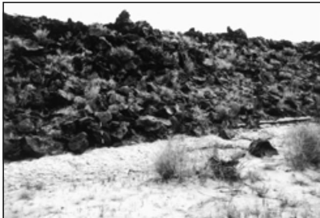
Figure 5. Massive (3 to 5 foot diameter) scoriaceous blocks of basaltic lava associated with the Merriam Crater lava flows which created the Grand Falls on the Little Colorado River.

... a slurry of glass shards, seawater and possibly steam. However, because of the generally low volatile contents of most basaltic magmas and the great water depth (>1200 m) [>3960 ft], it is likely that the eruption fountains are denser than the surrounding seawater and will rise primarily as a result of their initial momentum. Collapse of these fountains cause shard-rich (hyaloclastite) gravity flows that move away from the source and deposit bedded hyaloclastite layers. (Brackets mine)