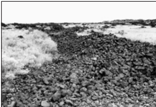
Figure 6. Smaller size (1 to 3 feet in diameter) scoriaceous blocks of lava from the SP lava flow in Arizona.

The volcanic fragmentation depth (VFD; Fisher and Schmincke, 1984) or the pressure compensation level (PCL; Fisher, 1984) is the maximum depth at which explosive eruption fragmentation can occur. Originally, McBirney (1963) predicted that explosive eruption of basaltic magma would not likely occur below 1500 feet beneath the water surface. According to Fisher (1984, p. 8),