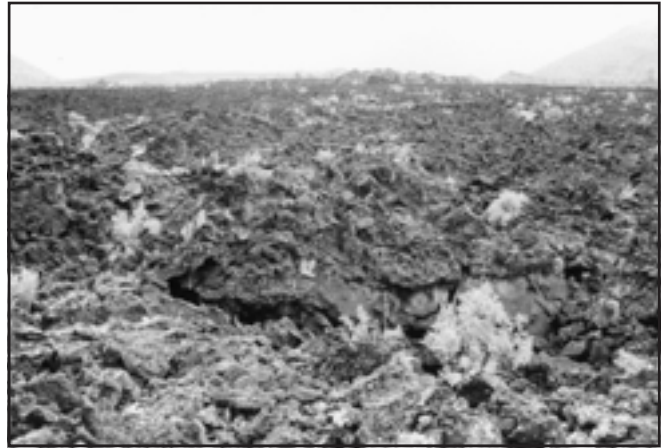
Figure 4. A massive aa lava flow (Bonito lava flow) found at the base of Sunset Crater in Arizona. This style lava has a rough and sharp surface which is believed to reflect low volatile content, slow flow rate, and low lava temperature.