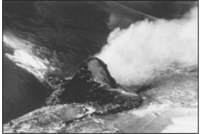
Figure 8. An active vent expelling volatiles from basalt lavas flowing beneath this structure. With sufficient volumes of basalt lava this vent could erupt and produce lava. Note the small volume of lava around the base of this vent which flowed toward the left side of the photograph.

The smooth-surfaced lava plains constitute the principle difference in volcanic morphology between these faster-spreading ridges and a slower-spreading ridge. These lava plains may be 0.5 km or more in width and may extend 2–3 km along the length of the valley. These plains have been provisionally called “sheet flows” by Ballard et al. (1979). Surfaces of some flows commonly consist of flattened pillows, giving a low, hummocky relief; other surfaces are flat, featureless, and divided into polygonal plates 2–10 m in diameter. This flat skin may be deformed and wrinkled to various degrees. This may produce intense crumpling and fracturing of the surface, or may result in whorls and ropy coils. The resulting flow-forms strongly resemble the various forms observed on smooth-surfaced subaerial pahoehoe lava and lava lakes. The various flow-forms do not necessarily delineate distinct flows, but may grade one into another on the surface of a single flow, and evidently result from different degrees of deformation of an ini-