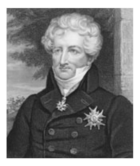
Figure 2. Cuvier was the most prominent French naturalist of the early nineteenth century. The father of comparative anatomy and paleontology, he advocated a catastrophic geohistory linked to Noah's Flood by its final catastrophe.

In Rudwick's theory, Georges Cuvier (1769–1832) emerges as the hero, navigating between the two "unmodern" extremes and charting a path for geology. In a series of public lectures presented in 1804, Cuvier (Figure 2) expanded far