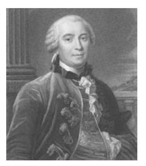
Figure 4. Georges-Louis Leclerc, Comte de Buffon. Modified from http://upload.wikimedia.org/wikipedia/commons/7/7f/Georges-Louis_ Leclerc,_Comte_de_Buffon.jpg

which is reinforced in another aspect of his work that Rudwick and most modern scholars regularly overlook. It is a point of logic that few grasp—thanks to Enlightenment apologists who insisted on a false dichotomy between "science" and "religion." But if the affirmation of Genesis is a religious position, then the rejection of Genesis must also be religious. Whatever his personal views, his overt materialism opened the door