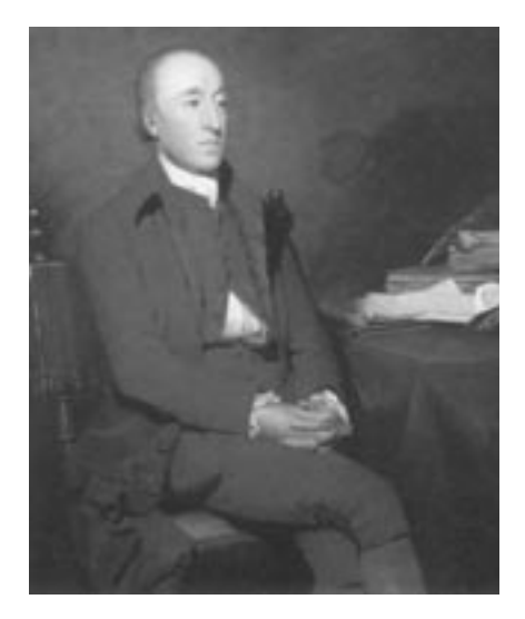
Figure 6. James Hutton.