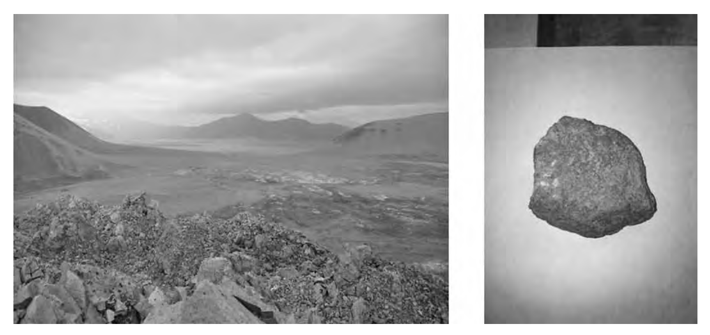
Figure 4. Left: July 28, 2009, author photo from top of Novarupta lava dome, looking west. Dark-colored mountains in background are the Buttress Range. Ash-covered Baked Mountain is on the right. Part of Falling Mountain is visible in the left foreground, with Mount Cerebrus directly behind it. Right: Novarupta rhyolite sample prior to sending off for analysis.

that the <sup>40</sup>Ar generated from the decay of <sup>40</sup>K escapes continually until the rock solidifies and cools (Dalrymple and Lanphere, 1969). Therefore, the rhyolite at the top of the dome (841 m above sea level) should have lost its excess argon before cooling, unless it cooled too quickly to release it. Also, since it was not surrounded by rocks with higher argon concentrations, it would not be possible to inherit argon from anything else. The sample also showed evidence of hydrothermal alteration, at least on the outside surface, providing more evidence that it was heated to high temperatures after solidifying, giving it further opportunity to reset its radiogenic argon to zero. Hildreth and Fierstein (2012) noted that the magma temperatures for the rhyolite dome probably exceeded 830° C, much higher than typical melting temperatures for rhyolite (650-800°C). Several decades ago, Bowen (1956) showed that high silica rocks have lower melting points than more mafic rocks.