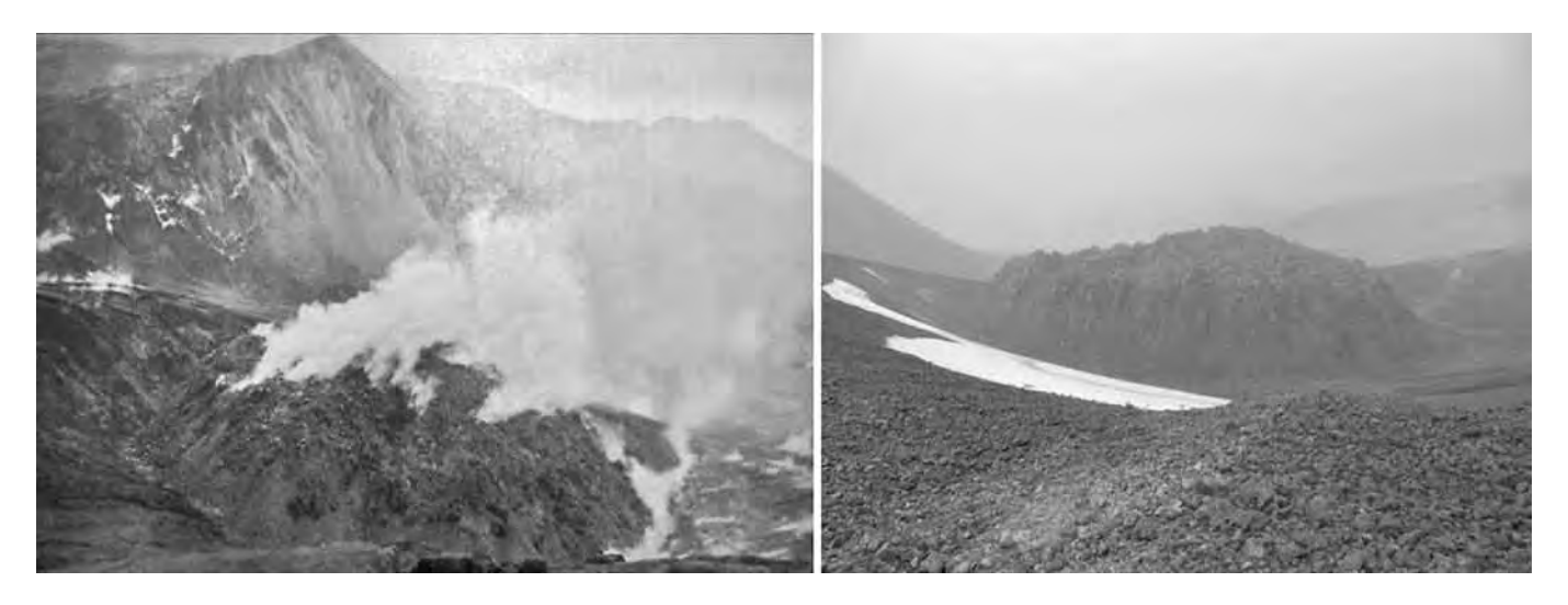
Figure 2. Novarupta then (left, from Griggs, 1922, p. 280) and July 2009 (right).

This paper focuses on the <sup>40</sup>Ar/<sup>39</sup>Ar method, and its predecessor, K/Ar. McDougal and Harrison (1999) give a thorough review of the method and its assumptions from a "deep time" perspective. The Ar/Ar method is believed to be more accurate, though when researchers dated samples less than 2,000 years old, the result were in error by over 70% (Overman, 2010). <sup>40</sup>Ar is the decay product of radioactive <sup>40</sup>K (<sup>40</sup>K also decays into <sup>40</sup>Ca). <sup>39</sup>Ar is produced by placing