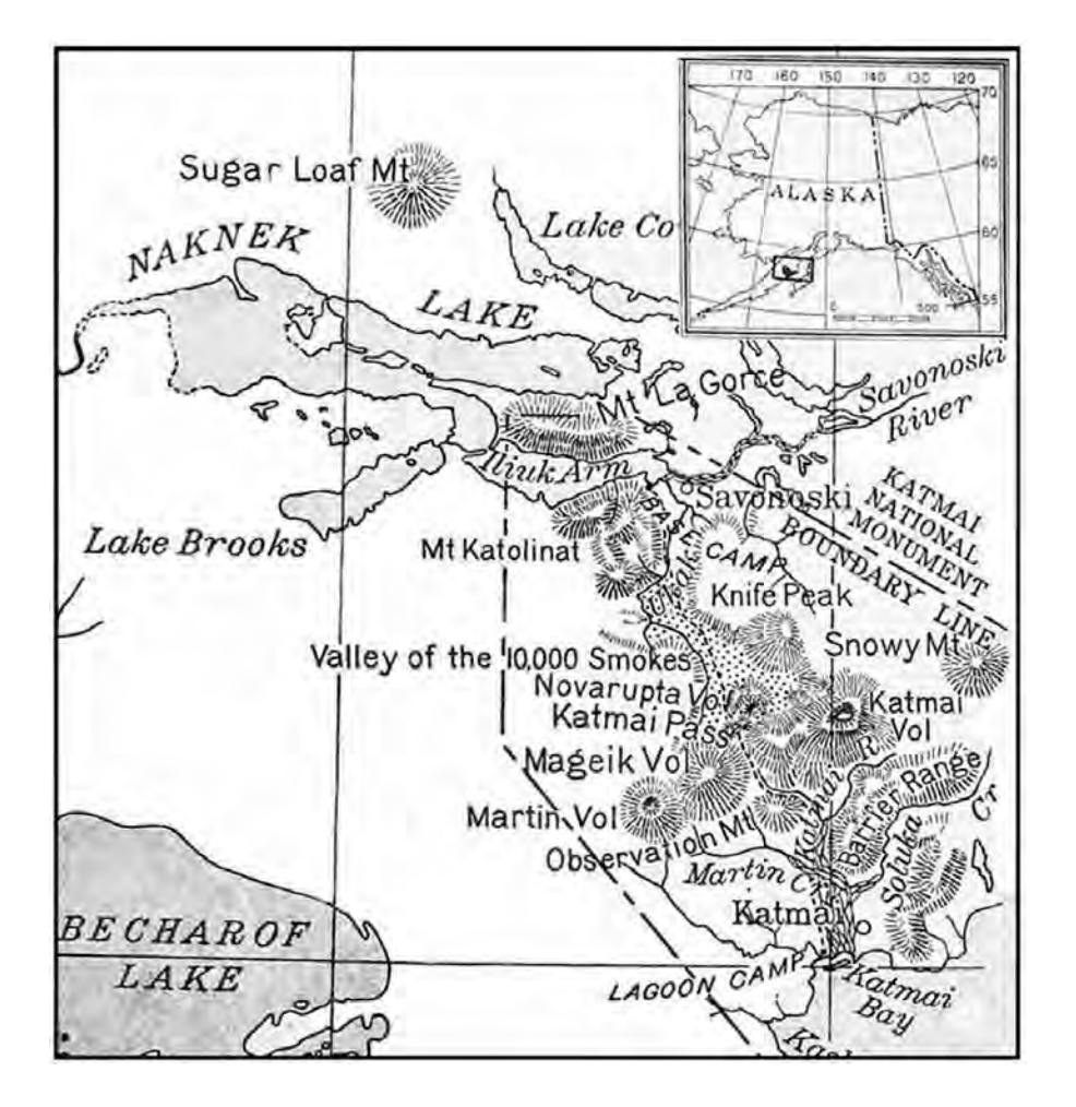
Figure 1. Map of The Valley of 10,000 Smokes, modified from Griggs (1922).

little about physical processes that might be associated with high-energy events, such as accelerated nuclear decay (DeYoung, 2005; Vardiman et. al., 2005).