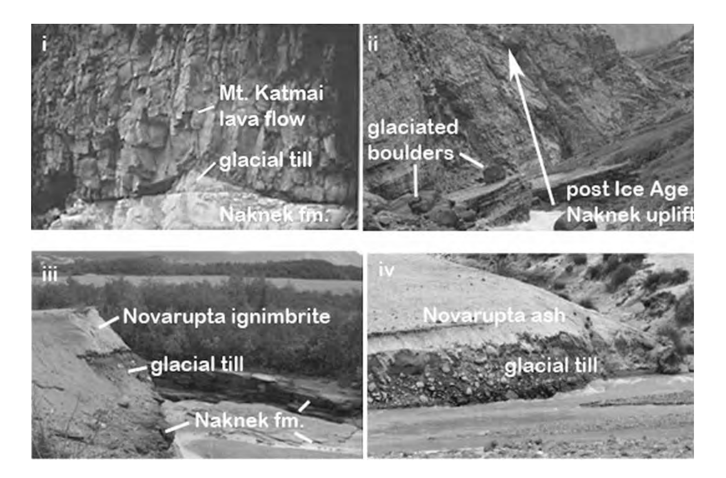
Figure 3. Evidence of the Creation/Flood/Ice Age/Stasis pattern is everywhere in the Novarupta-Katmai region. The waterdeposited and sedimentary Naknek formation was probably a Flood deposit, followed by Ice Age glacial action, with volcanic mountain forming during and after glacial retreat. Photo i from Katmai Canyon by Griggs (p. 125). Photo ii (2011) shows post-Ice Age uplift of Naknek formation between Mount Katmai and Noisy Mountain, with glacially smoothed boulders still resting on uplifted blocks. Photo iii shows Flood/Ice Age/Stasis pattern along upper Ukak River. Photo iv (2011) shows Ice Age/Stasis pattern in extreme upper Katmai Valley.

the sample in a nuclear reactor and bombarding it with fast neutrons, converting <sup>39</sup>K to <sup>39</sup>Ar. This allows for two gases to be measured in a mass spectrometer, reducing the chances of measurement errors (Snelling, 2009). Assuming the ratio of <sup>40</sup>K/<sup>39</sup>K is a constant, the <sup>39</sup>Ar is therefore an estimate of the original parent amount of <sup>40</sup>K. Or: