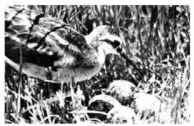
Male phalarope Steganopus tricolor at nest.

Friend phalarope's domestic dilemma may have been a faux pas, but the solution of its source can be solved only in the divine decree of creation and its pattern of purpose.