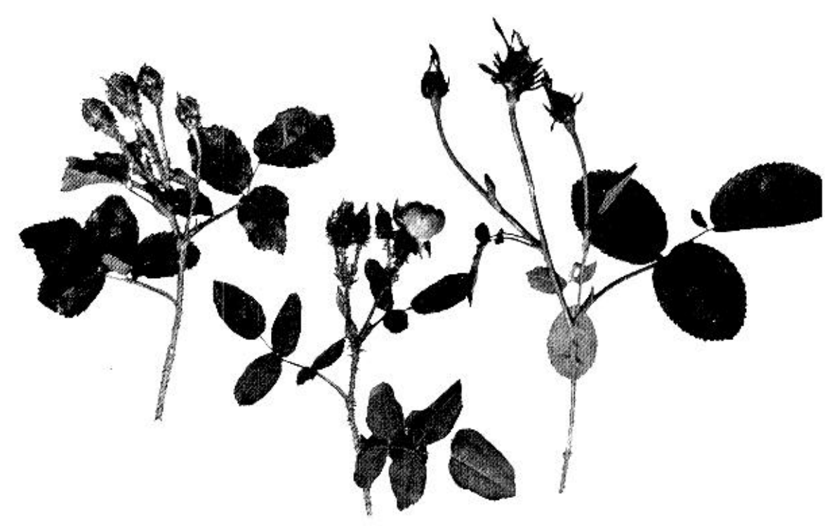
Figure 4. Variations in expression of moss rose traits. Left to right: Salet, Gothe. and unidentified Old Rose-Crested Moss type.

island of Mauritius the true and/or only source of discovery of this mutation, Rosa chinensis minima?