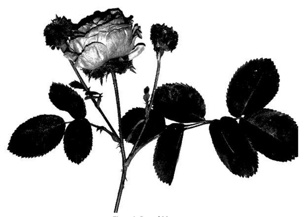
Figure 2. Crested Moss

ing character of the Hybrid Tea parent was lost in the F_1 generation. Finally, however, I now have everblooming moss roses with a degree of moss on the buds comparable to the lovely old fashioned moss roses, such as Golden Moss and Pink Moss.