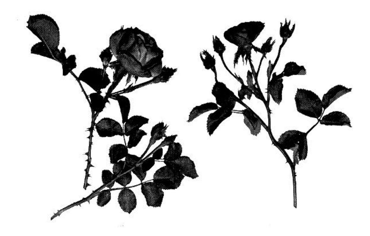
Figure 1. Variety on left is bright pink with 20 petals and two and one-half inches in diameter, sets seed hips.

bundas in the breeding line; while, in Italy, Q. Mansuino has worked with miniatures for more than 20 years but only this spring are the first of his varieties being introduced by an Italian firm.