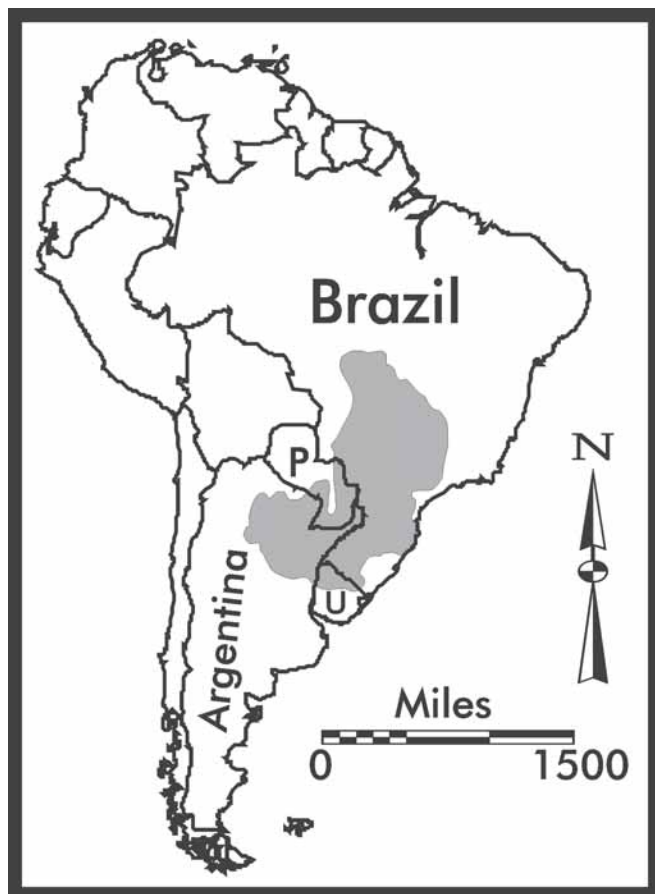
Figure 1. The Paraná Basin (shaded) occupies southern Brazil, and parts of Uruguay (U), Paraguay (P), and Argentina. Most of the exploration for hydrocarbon and coal has occurred in Brazil. Figure modified from França and Potter (1991), and Eyles, Eyles, and França (1993).

The silty-coal deposits found in the Paraná Basin are best understood as having occurred under catastrophic conditions, where materials were eroded from upland areas by gigantic floods, and transported and deposited in a marginal-marine fluvial-deltaic setting. Soon thereafter, destabilizing conditions must have occurred where the newly deposited clastics and organic materials were transported further offshore by turbidity currents. This is a dramatic departure from the standard uniformitarian model of a coastal swamp with occasional marine incursions resulting in the burial of organic layers later forming coal deposits (see McCabe, 1984).